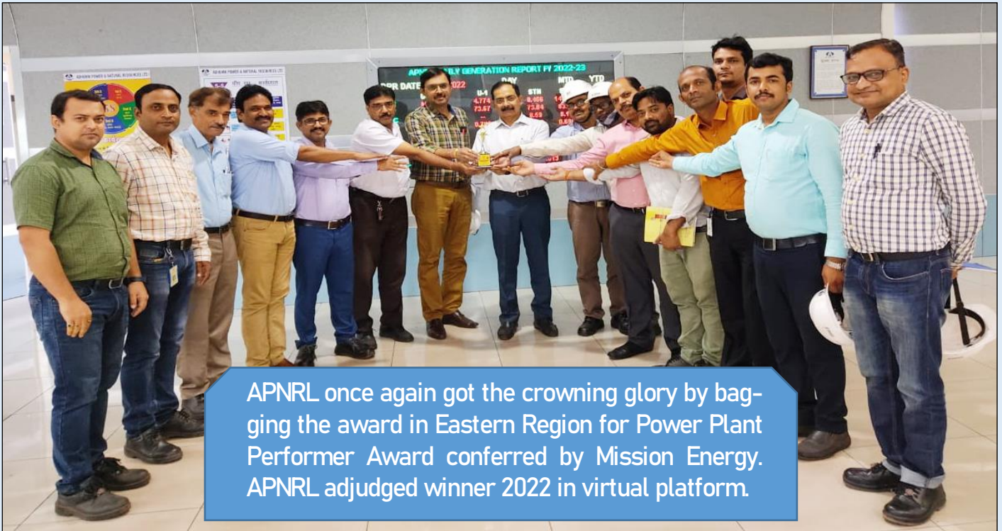
APNRL once again got the crowning glory by bagging the award in Eastern Region for Power Plant Performer Award conferred by Mission Energy. APNRL adjudged winner 2022 in virtual platform.